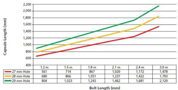
Figure 4 - Theoretical Encapsulation + 10%