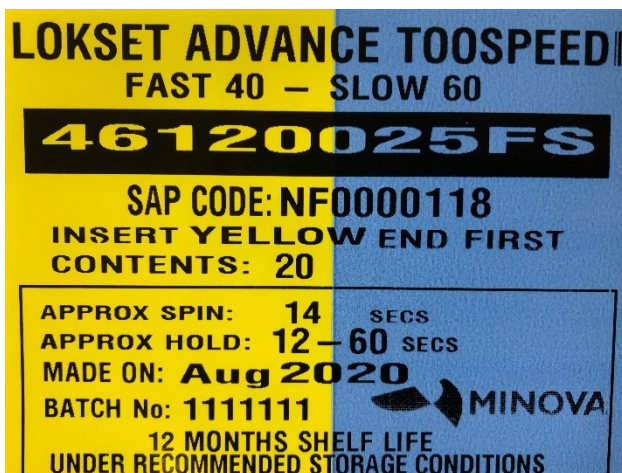
Figure 5 - Capsule Label

Example of capsule label: Lokset Advance Toospeedie Fast Slow.