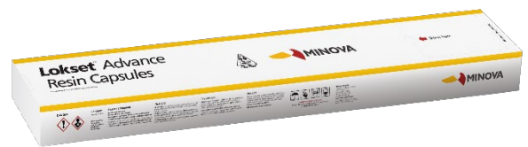
Figure 1 - Lokset Advance Resins

The Lokset Advance resin capsule consists of a reinforced, thixotropic polyester resin mastic in one compartment and an organic peroxide catalyst separated by a physical barrier in the other. The rotation of the bolt during installation ruptures the capsule, shreds the skin and mixes the two components causing a chemical reaction and transforming the resin mastic into a solid anchor.