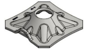
Figure 2: 8L Crown Plate